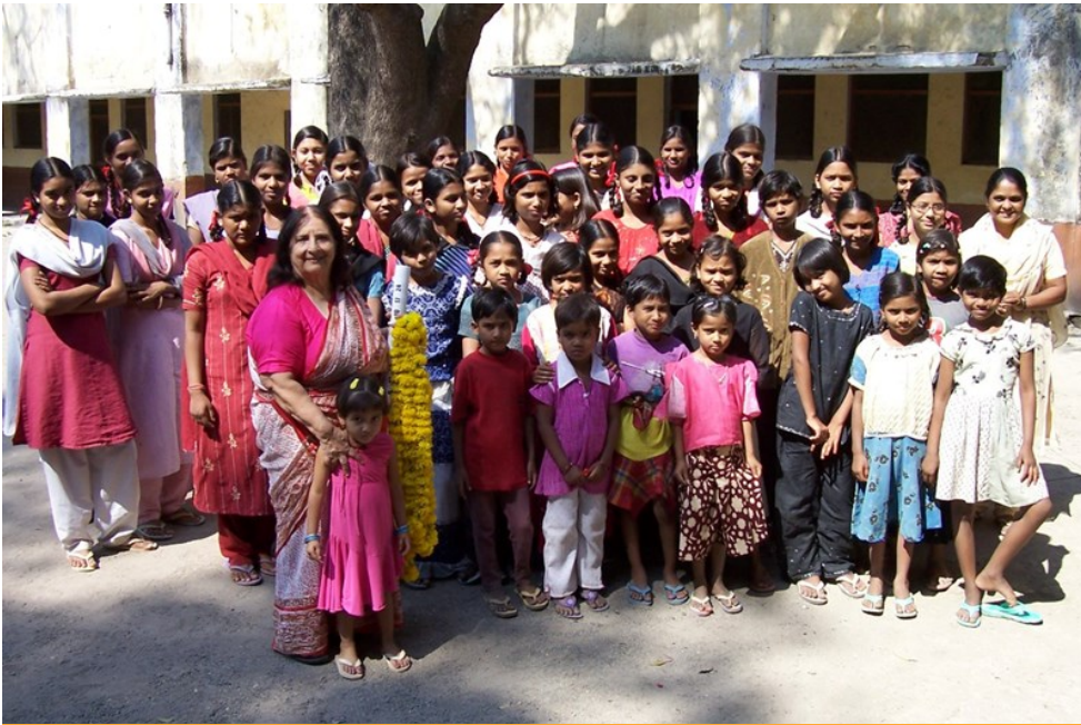
EMPOWERMENT THROUGH EDUCATION

Dr. Mina MacKenzie Memorial Trust Fund 6 Esker Drive, Brampton, Ontario L6Z 3C5 Phone: 905-840-3390 Interac eTransfer: admin@minatrustfund.ca