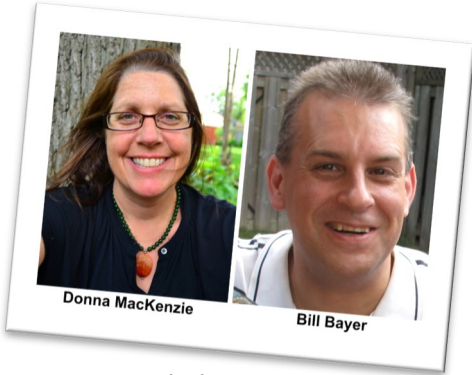
Continuing the legacy ...