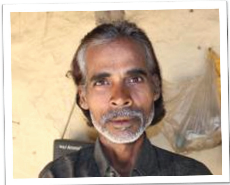
Mina Fund donors support life-saving community outreach work at Broadwell Christian Hospital.