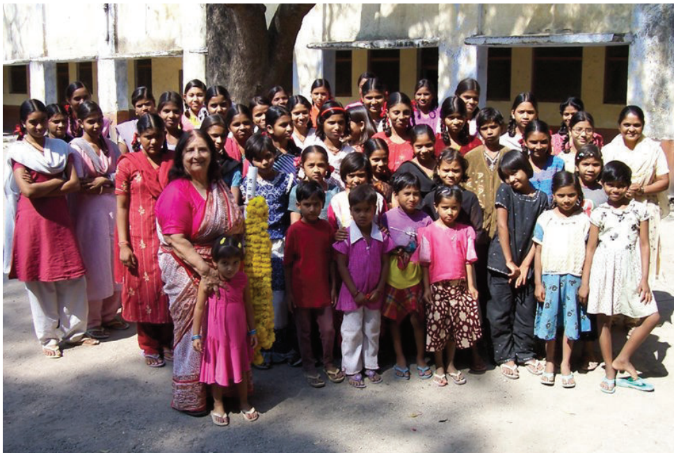
EMPOWERMENT THROUGH EDUCATION